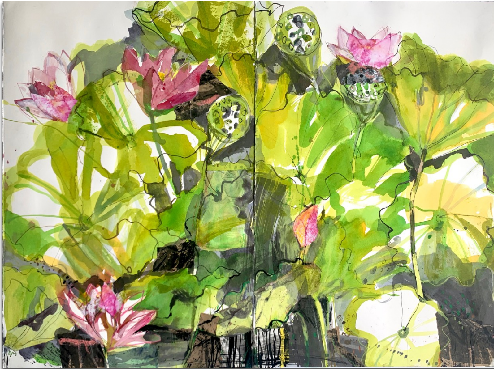
New Life (diptych) mixed media and collage 70 x 100 cm unframed $1500 framed price POA